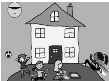
Spring is almost here.

With the warmer weather coming, more children will be out and about playing.