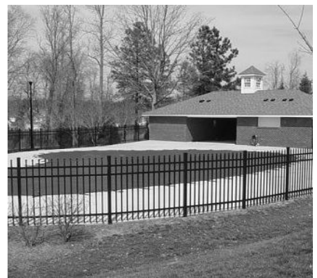
The Valleyfield Pool (winter)

The pool will open for the 2008 season on May 10th with the season closing on September 13th.